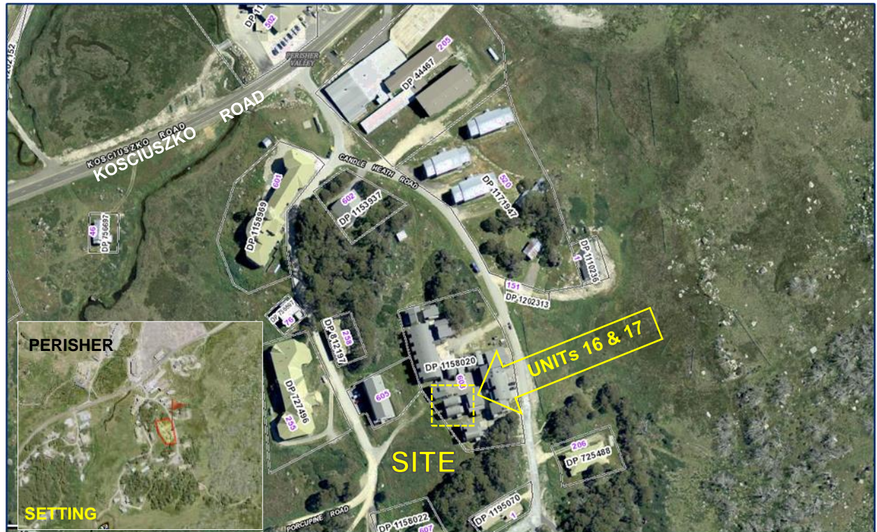
Figure 1 | Location of The Stables within Perisher

The application seeks approval to undertake alterations and additions to the first floor of Units 16 and 17 within The Stables tourist lodge accommodation, located at 20 Candle Heath Road (Lot 603 DP 1158020), Perisher Valley, which is within the Perisher Range Alpine Resort in Kosciuszko National Park (KNP) – Figure 1 .