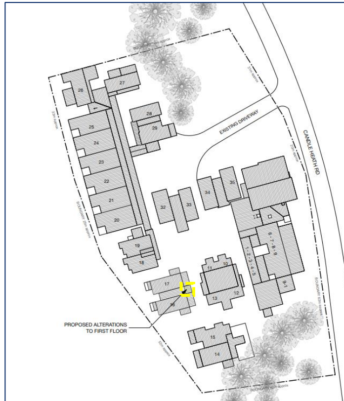
Figure 2 | Location of Unit 16 and 17 within The Stables